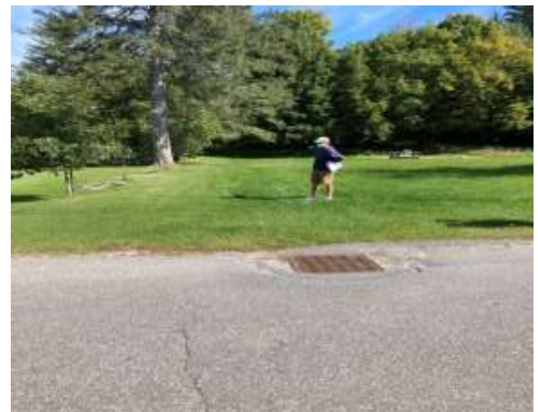
Hazen Walking Path

8) No crosswalks exist at the intersection at the beginning of West Church Street and there are no additional crosswalks on West Church Street. There is a path which is utilized by the students at Hazen Union (see photo to right) and students were observed walking on the north side of the street. This side does not have a sidewalk and is used as the travel lane by both directions of traffic. A crosswalk to the sidewalk is recommended. The expansion of the public library may increase traffic at the intersection of Church and North Main Street. A crosswalk in this location is also recommended. In addition, the Lamoille Valley Rail Trail may create a further need for a safe crossing on West Church Street.