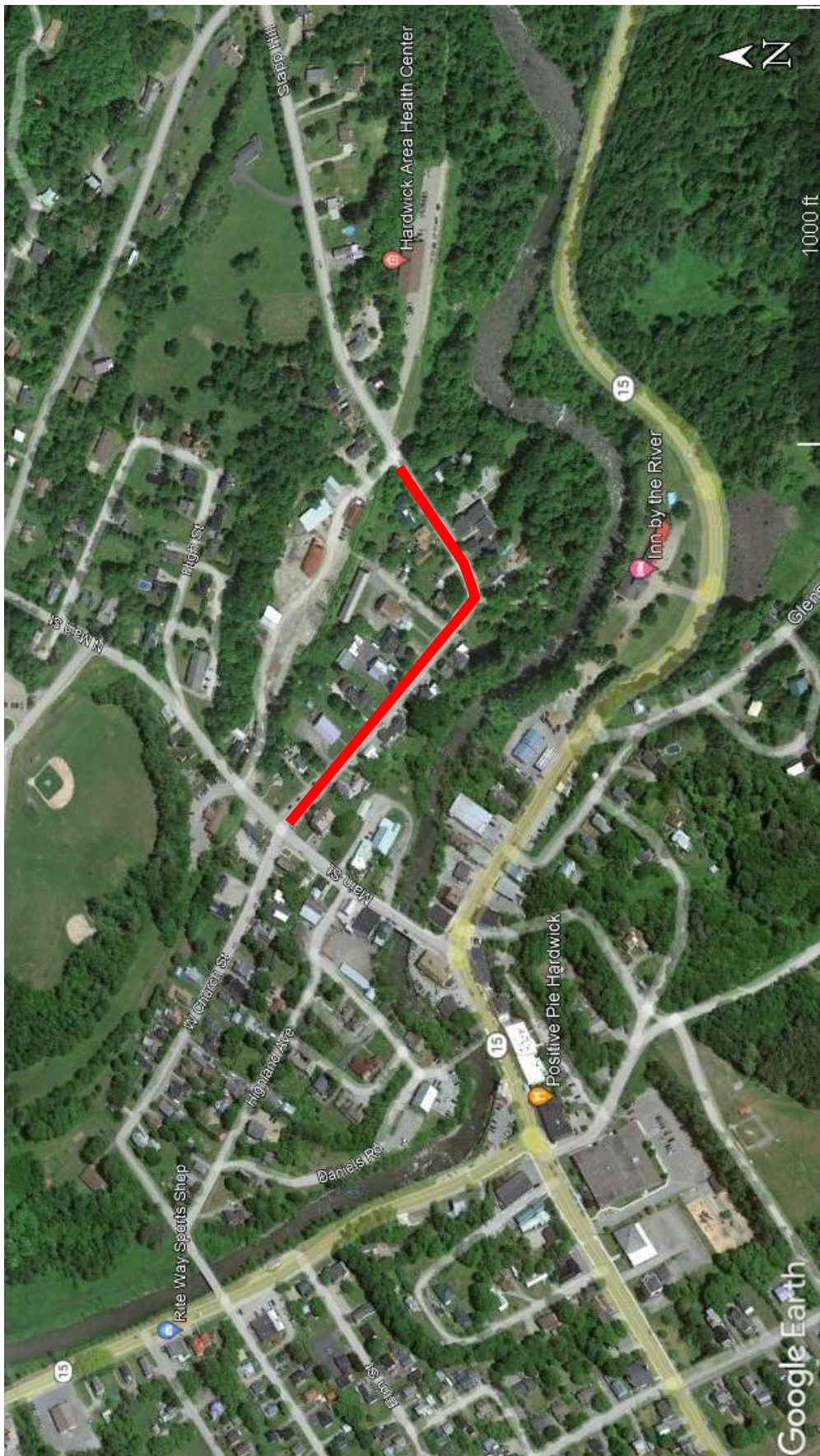
Map of project location as indicated by red line.