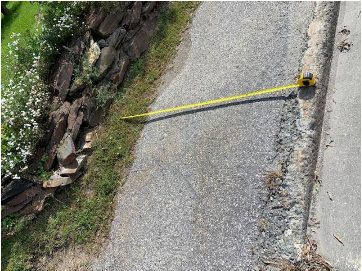
Image of stone retaining wall at 39 Church Street. Measuring tape indicates the width of the proposed new sidewalk in front of the wall.