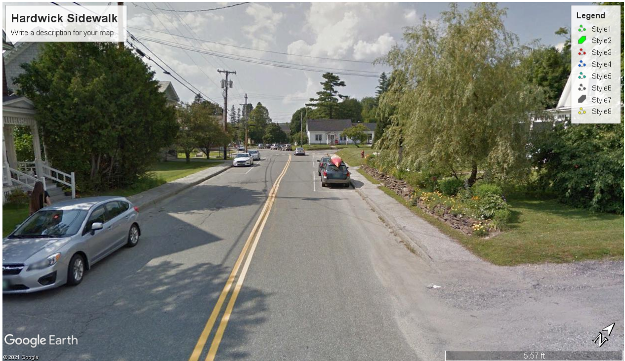
View of existing sidewalk at west end of Church Street, Hardwick.