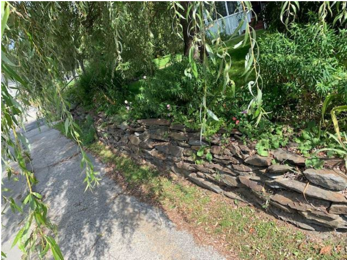
Stone wall at 39 Church Street (second view).