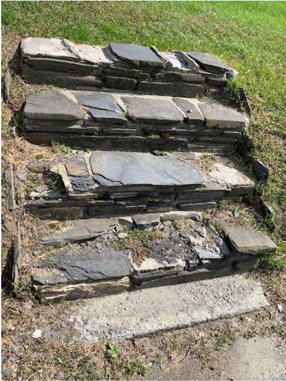
Image of stone steps at Memorial Park.