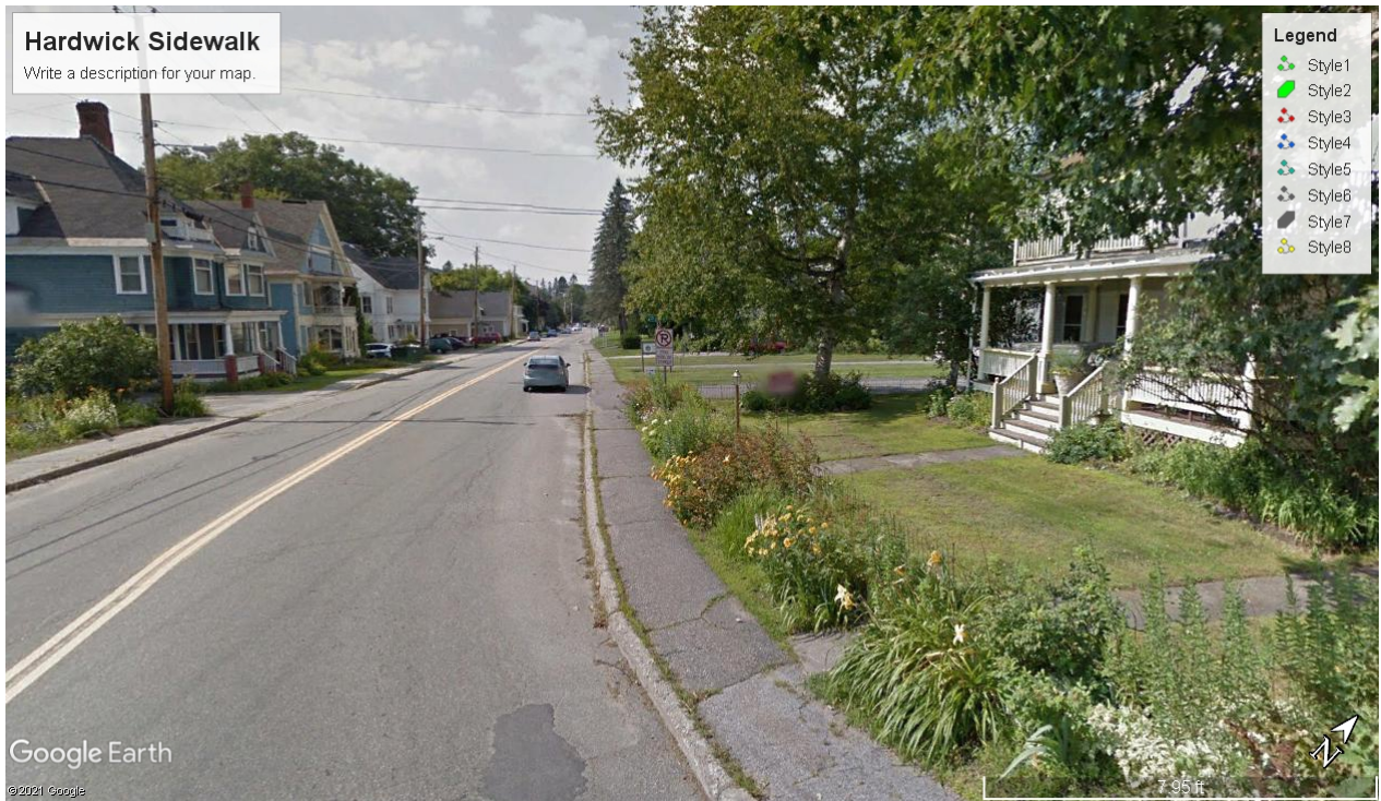
View of existing sidewalk at east end of Church Street, Hardwick.