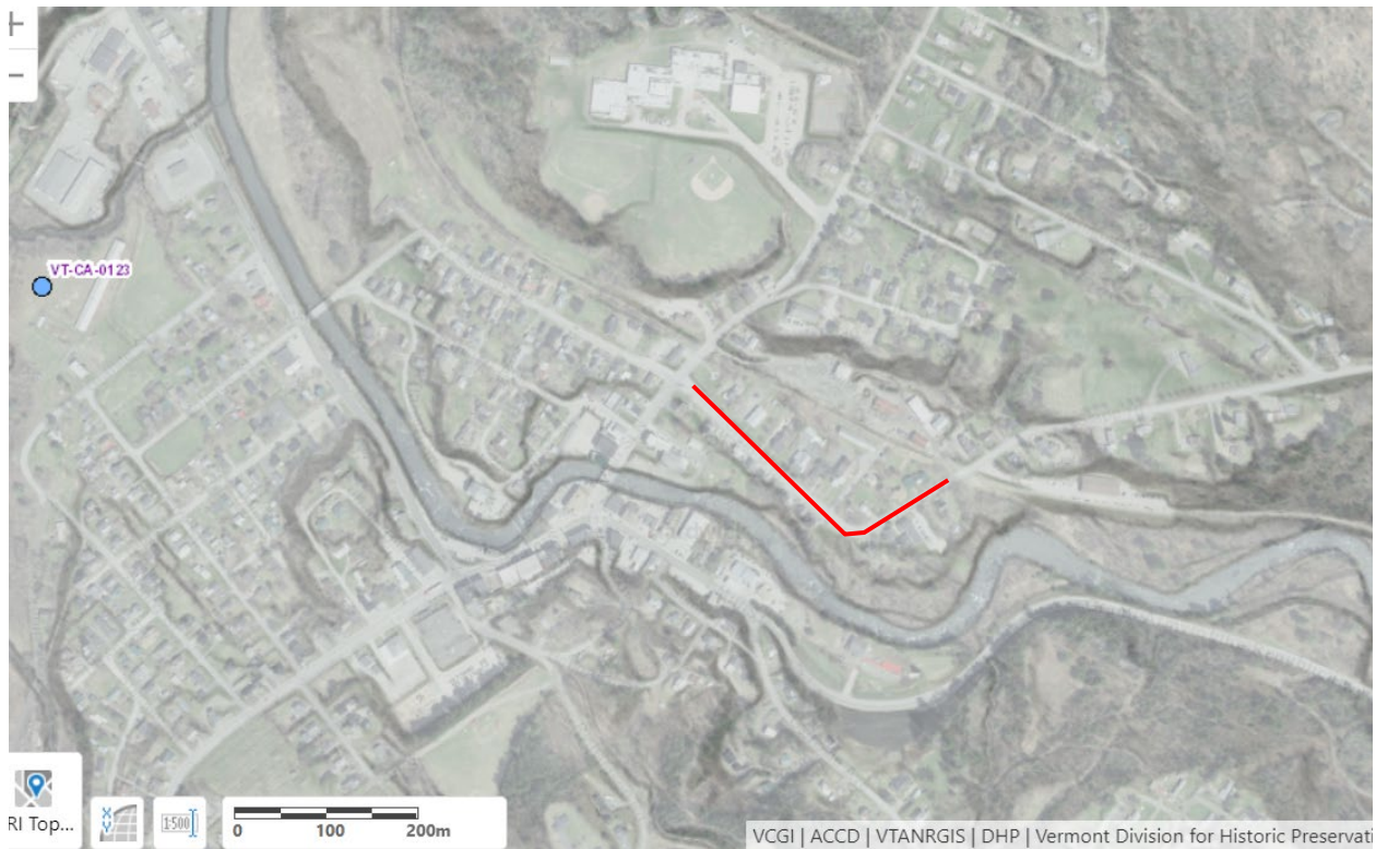
ORC image showing project area – red line. Note historic arch site at far left of image.